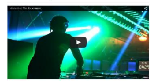
Dance More, Drink Slow