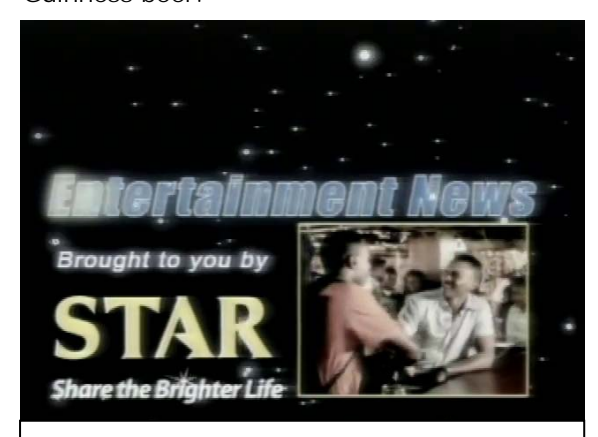
Figure 2. Sponsor message by Star Beer before a news programme.

Generally, not much advertising is broadcasted on these private channels from either alcohol brands or others brands. Noticeable, however, was the sponsorship of programs by alcohol producers, which show the logo and slogan of the brand in the screen during almost the whole program. Popular programs that have been sponsored by alcohol producers are Big Brother Africa by e.a. Star beer and Ultimate Search by Guinness beer.